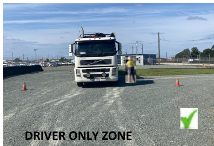
DRIVER ONLY ZONE