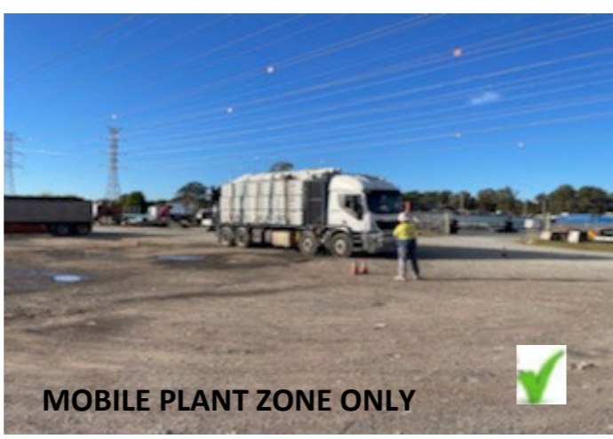
MOBILE PLANT ZONE ONLY

No Entry Unless Positive Communication and the mobile plant has stopped moving and forks/tynes grounded